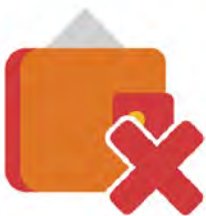
Wallets / Purses