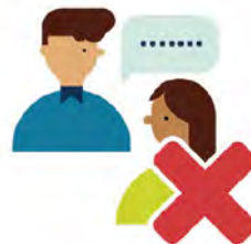
Chatting / Disturbing others