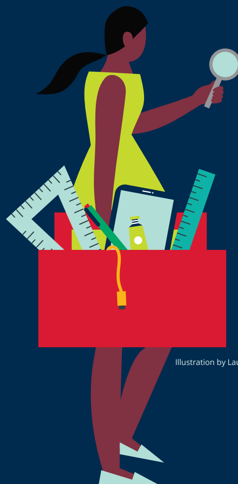
Illustration by Lauren Rolwing