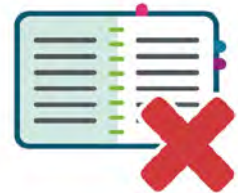
Books / Notes