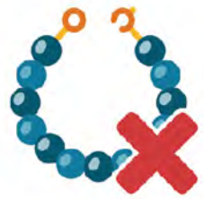
Jewellery thicker than ¼ inch (½ cm)