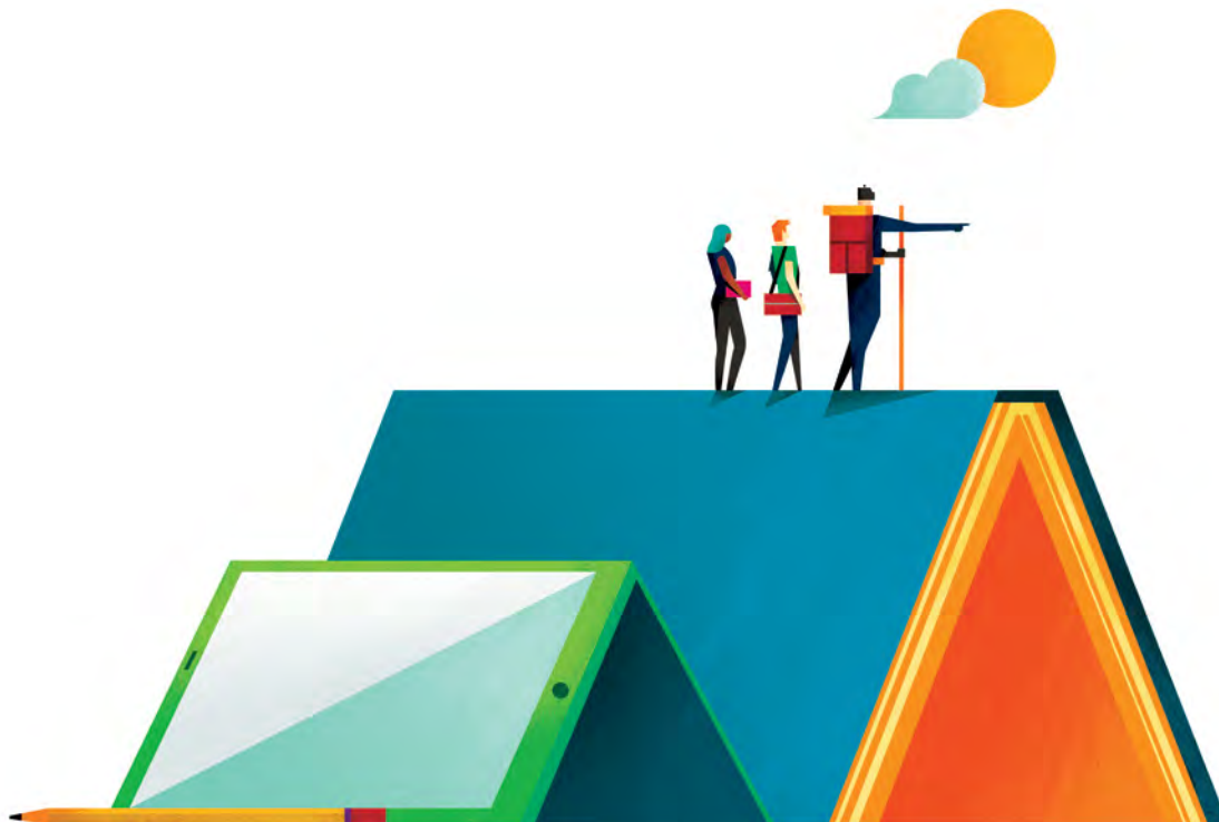
Illustration by Dan Matutina

of your Score Report being made available to you. The fee for rescoring is available from this team. The phone number can be found at pearsonpte.com/help-center under 'Retake or request a rescore'.