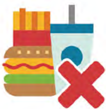
Eating / Drinking / Chewing gum